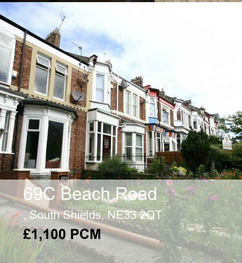
69C Beach Road , South Shields, NE33 2QT £1,100 PCM